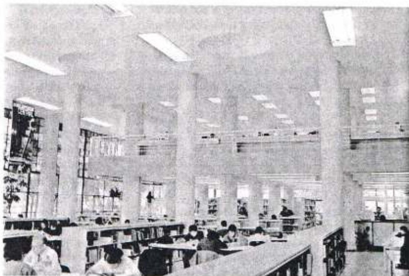
Electronic Reference Department, Central Library, UNAM.

Another union catalogue which can be consulted online is Seriuam, which was compiled by the UNAM's Department of Libraries; the 219 current periodical titles, available on the website of UNAM's Instituto de Investigaciones Estéticas, are an example of what one library can bring to the Investig@rte project. This site also includes links to the indices. A further addition to the project, from the same library, is the Bexart database, which contains records for 10,796 exhibition catalogues.