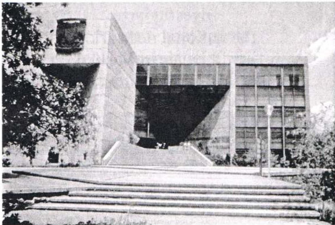
National Library, National Autonomous University of Mexico (UNAM)