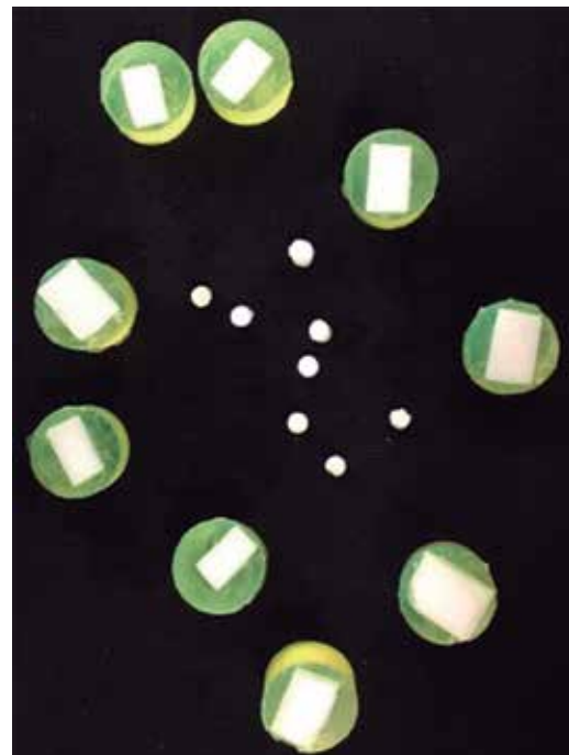
Figure 5. Ketac Cem, 3M™ ESPE™ glass ionomer.

Bonding agents have been developed in recent years. They have been introduced to improve bonding strength of ceramic to zirconium. When using RelyX® Elite and Multilink® Automix, the manufacturer recommends, in an alternative manner, to use systems with imprints or bonding agent Single