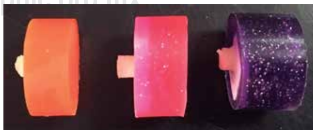
Figure 3. Samples of all three resin cements.

Ketac Cem (3M™ ESPE™) glass ionomer samples were discarded, since during manufacturing, all 10 samples failed ( Figure 5 ).