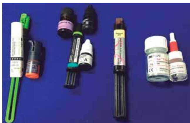
Figure 2. Cements used in the study.

Forty 7 x 7 mm square samples of Zirconia Lava™ Plus, 3M™ ESPE™ were obtained. They were sintered at 1,450 °C for 8 hours, according to manufacturer's instructions in an oven program S1P1600, Ivoclar Vivadent.